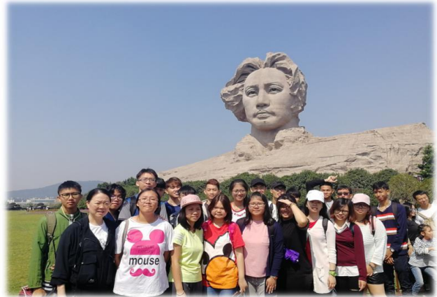
图8 亲历长沙--橘子洲头 Experience Changsha--Orange Isle