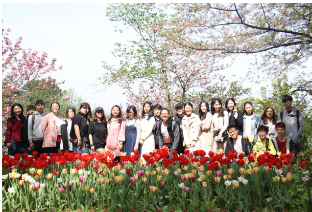
图7 亲历长沙--春暖花开 Experience Changsha--Spring Blossom