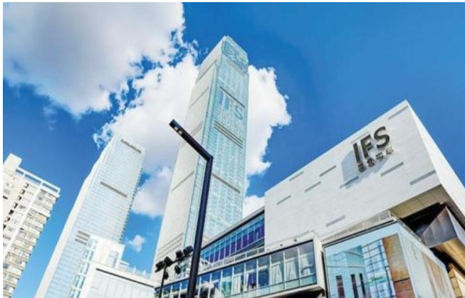
图 13 长沙最高楼-九龙仓国际金融中心