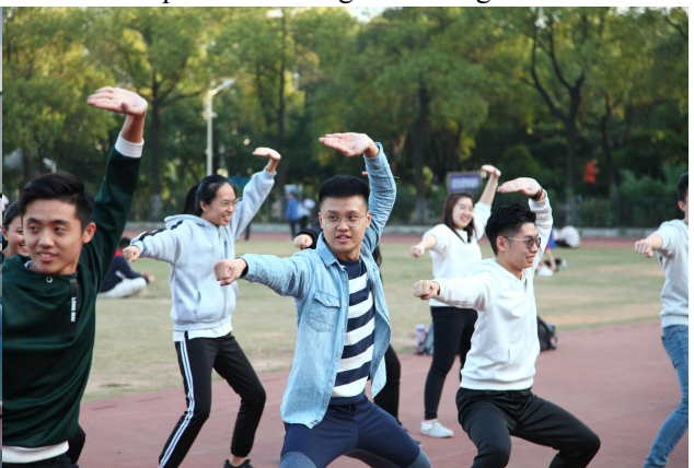
图10 “感知中国” 文化课--习中华武术 Reading China--Chinese Kung Fu Class