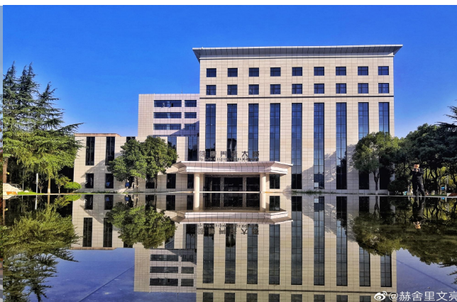
图 2 中心广场 Central Square