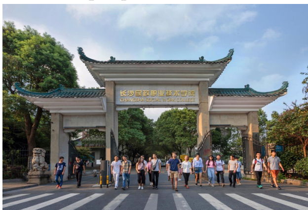
图 1 学校大门 School Gate