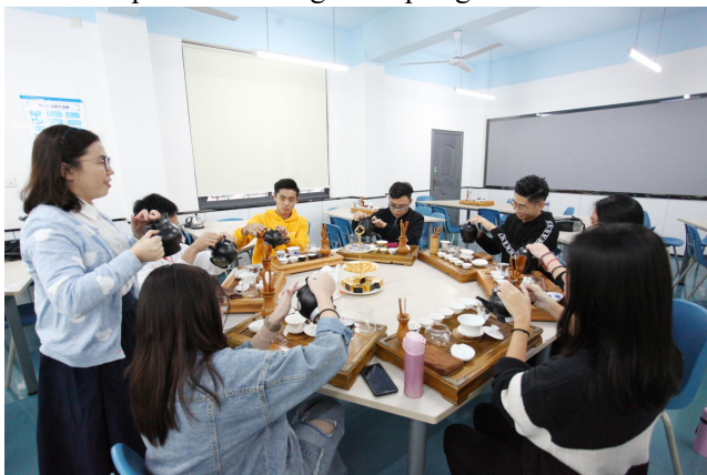
图9 “感知中国” 文化课--品清香茗茶 Reading China--Chinese Tea Culture Class