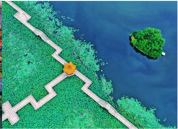
图6 笃行湖 Duxing Lake