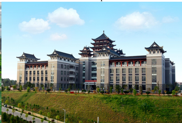
图 4 图书馆 Library