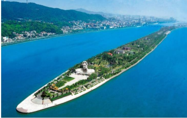
图 11 橘子洲