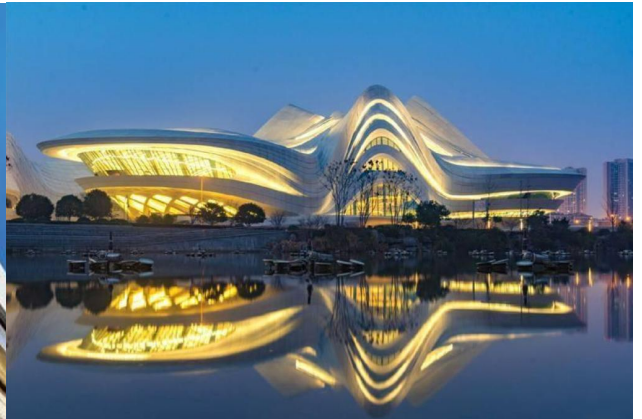
图 14 梅溪湖国际文化艺术中心

Meixihu International Culture and Arts Center