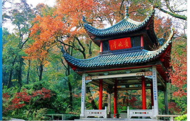
图 12 岳麓山爱晚亭